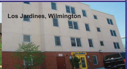
Los Jardines, Wilmington