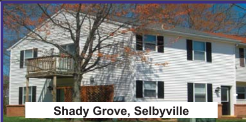
Shady Grove, Selbyville