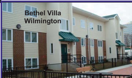
Bethel Villa Wilmington