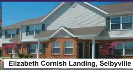
Elizabeth Cornish Landing, Selbyville