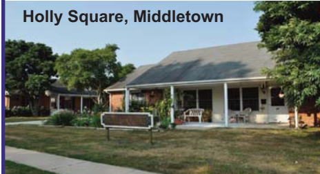
Holly Square, Middletown