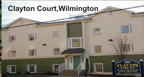
Clayton Court, Wilmington