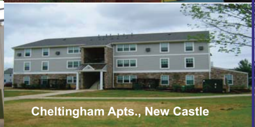
Cheltingham Apts., New Castle