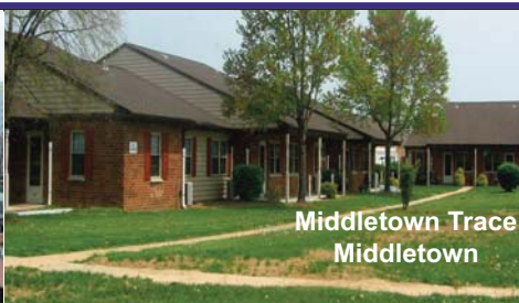
Middletown Trace Middletown