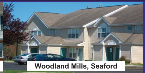
Woodland Mills, Seaford