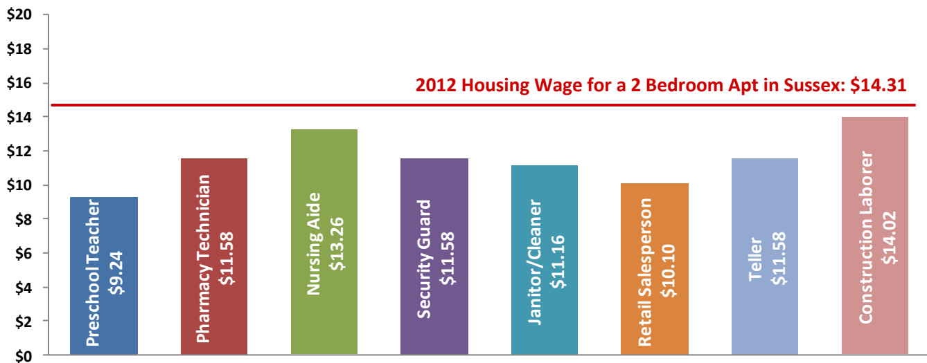
Median Hourly Wages of Selected Occupations and the Housing Wage 8